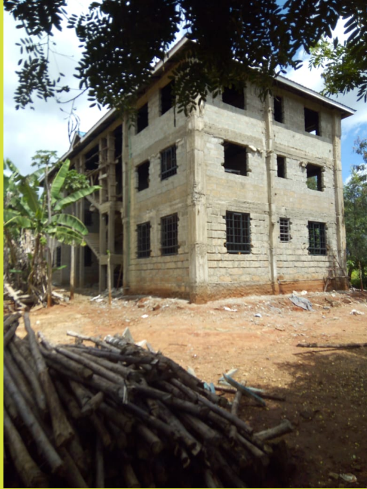
Mission Hope: Construction at Kakuswi